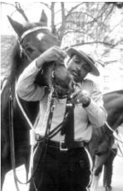
Endangered Species Park Rangers.