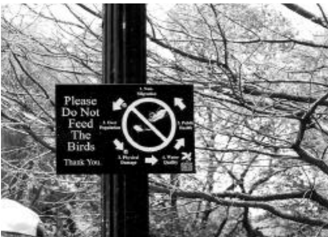
Unheeded Admonition, Public Garden.