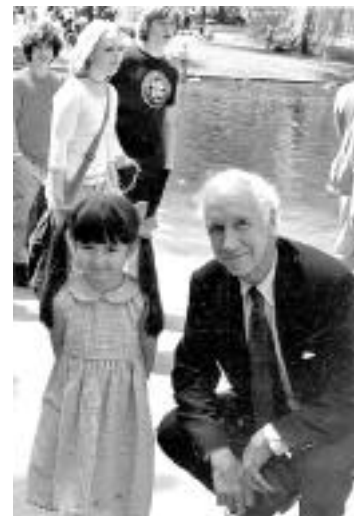
The Writer and Young Friend Inspecting the Garden.