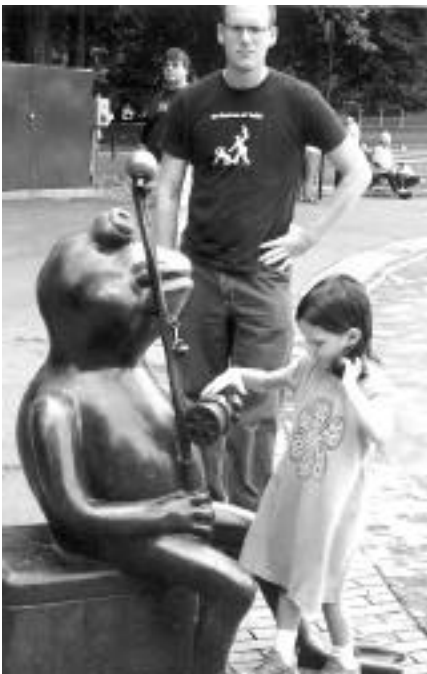
Bronze Frog for the Playground and Frog Pond.

If not yet Tivoli Gardens, the Common is providing an impressive amount of entertainment. The Commonwealth Shakespeare Company, now an annual fixture, offered in July-August a handsome production of Macbeth . Last