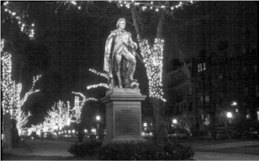
Glover Monument, Commonwealth Avenue Mall, in Holiday Glow.