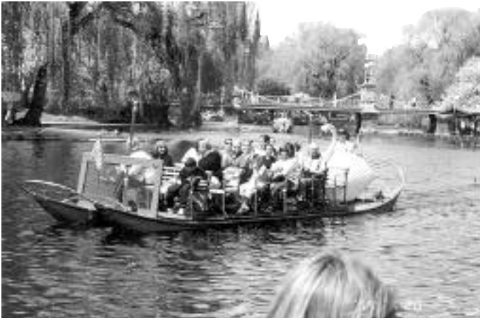
The Swan Boats, 126th year.

their return. Hence, we have gains but as yet no victory.