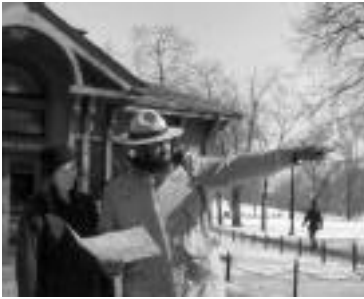
Park Ranger.

As noted, budget estimates called for elimination of the Park Rangers, who have served a critical role in protecting the parks from misuse, accommodating visitors, and