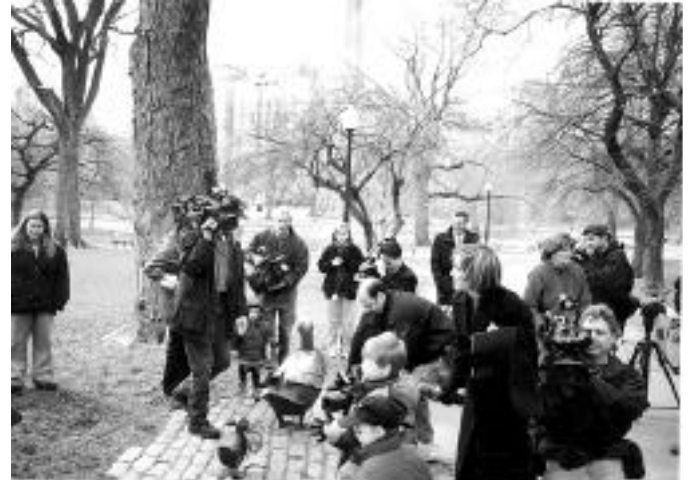
Mrs. Mallard, Ever a Center of Attention.