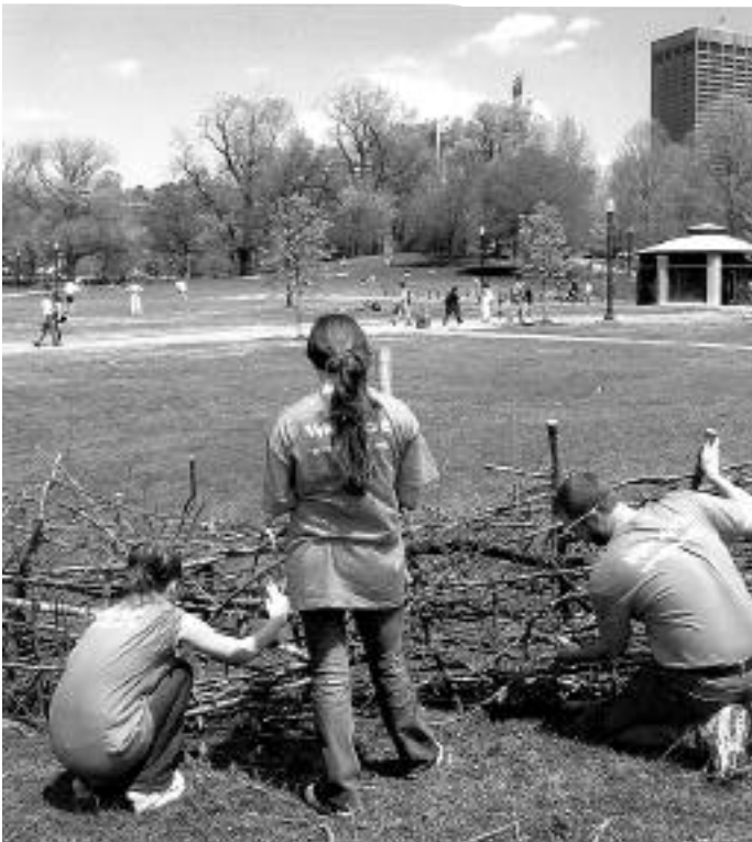
Creating a Replica of the Ancient Fishweir.